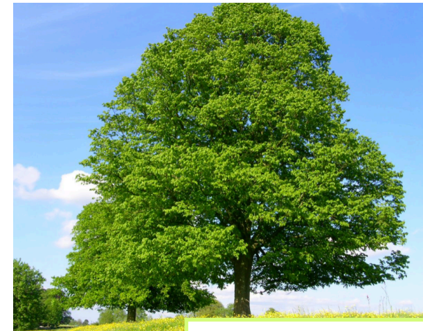
A tree during summer.